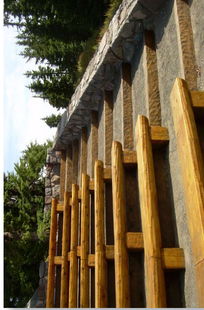
Amphitheater Restoration completed by FOT, 2005

Your gift will help FOT support efforts to protect the historical integrity and the conservation and preservation of Timberline Lodge. By including a financial contribution in your Will/Trust and /or estate plans, you can leave a meaningful legacy. Planned Giving is accessible to nearly everyone.